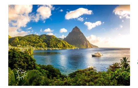
Sun-kissed St. Lucia