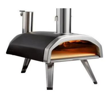
Pizza Oven - Delicious!

Over 50 items and experiences to choose from. Your purchase helps support the services and programs that Long Islanders depend upon every day!