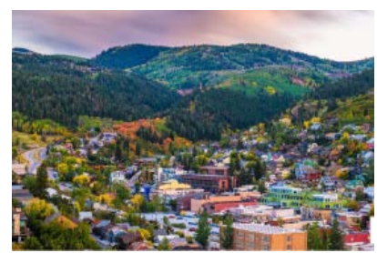
Ski Park City Utah