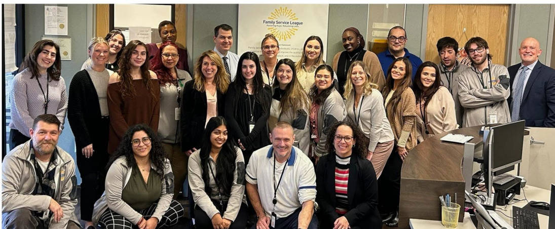
FSL's DASH Team

FSL's DASH 24-hour HOTLINE, crisis care center, and mobile teams are available for children and adults experiencing a severe mental health or addiction issue. DASH is often an alternative to a traditional Emergency Room. If you or a loved one is struggling, please reach out today! DASH 24-hour Hotline 631-952-3333